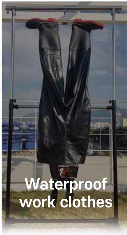
Waterproof work clothes